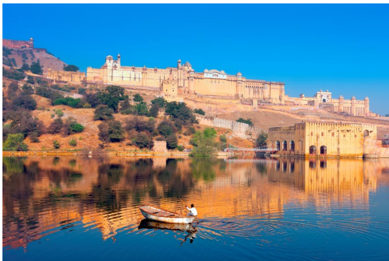
Amber Fort, Jaipur

Indian Odyssey: Arriving in India, whether for the first or tenth time, is a real adventure. Tuk tuks, taxis and rickshaws jumble for space on the roads in what, at first, appears chaotic but on closer inspection works like a carefully choreographed dance. You'll never