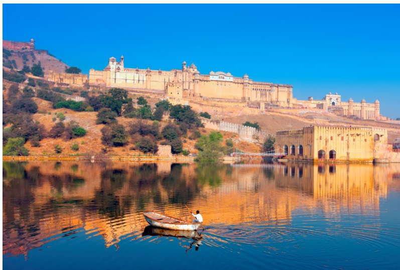
Amber Fort, Jaipur

Indian Odyssey: Arriving in India, whether for the first or tenth time, is a real adventure. Tuk tuks, taxis and rickshaws jumble for space on the roads in what, at first, appears chaotic but on closer inspection works like a carefully choreographed dance. You'll never forget the look on your children's faces, eyes out on stalks at the sights, sounds and smells and sheer awe of this truly beautiful country. Discover the desert landscapes of Rajasthan and the trio of cities that make up The Golden Triangle. India is a country your children will remember forever.