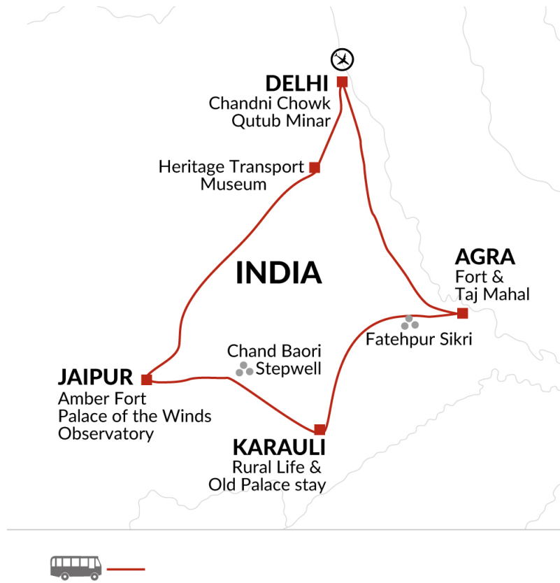
GTI 2020 map