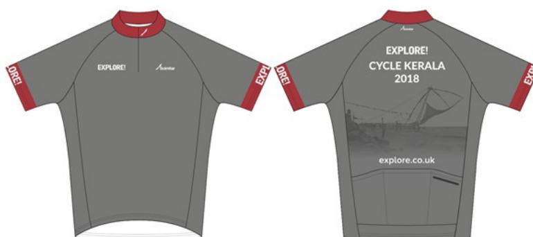
Cycle Kerala Jersey

Cycle Kerala Jersey - Click here to order