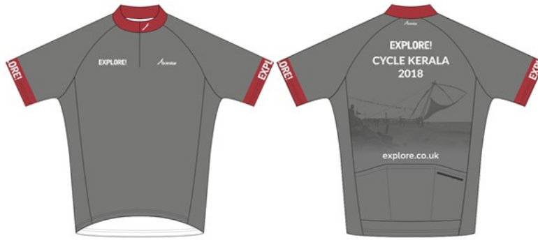
Cycle Kerala Jersey

Cycle Kerala Jersey - Click here to order