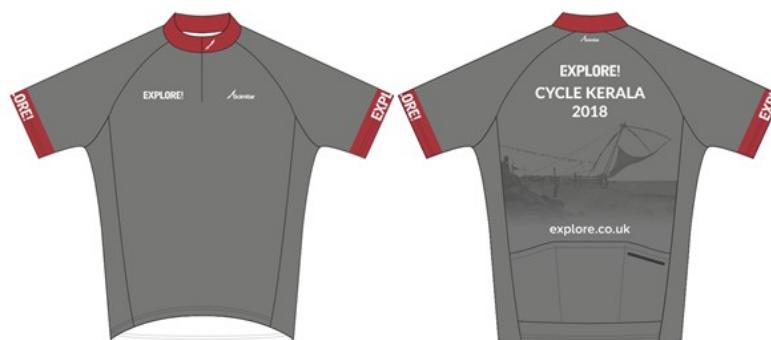
Cycle Kerala Jersey

Cycle Kerala Jersey - Click here to order