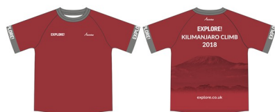
Kilimanjaro Climb top