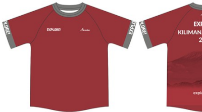
Kilimanjaro Climb top