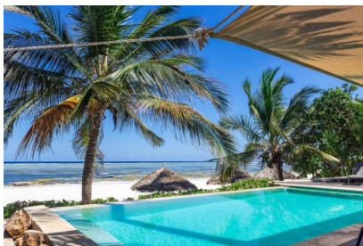
Pool at the Sunshine Hotel, Matemwe