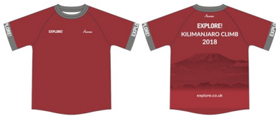
Kilimanjaro Climb top