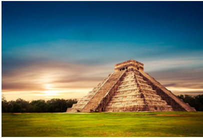
Extend your trip into the Yucatan Peninsula

Why not extend your trip with four nights on Mexico's Yucatan Peninsula, including a visit to the famous Maya site of Chichen Itza. Click here for more details.