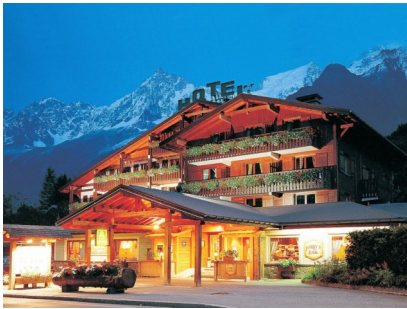
Hotel du Bois

This trip stays at the Hotel du Bois, an attractive alpine chalet in the village of Les Houches, a few kilometres from Chamonix which can easily be reached by local bus. It makes a great base for accessing some of the most beautiful walking in the Alps. The hotel's restaurant serves French cuisine and wine and there is a cosy bar with outside seating where you can enjoy a drink in the sunshine; an ideal spot to wind down after a day walking. The large garden has wonderful views of Mont Blanc and the Chamonix Valley and the hotel has a heated indoor pool and a sauna.