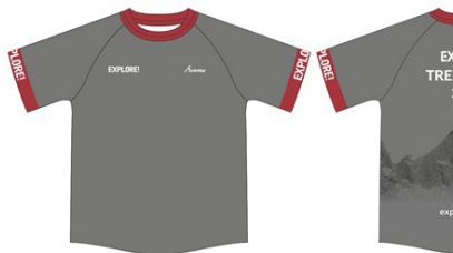
Trek Nepal top