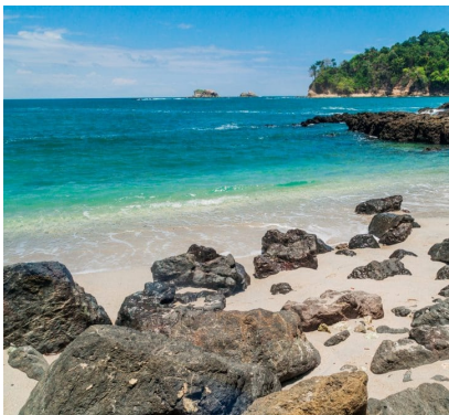
Beach in Manuel Antonio National Park

Nature's paradise: With a quarter of Costa Rica designated as protected land and with over 5% of the world's biodiversity, Costa Rica is a truly wildlife-lover's paradise and a fantastic destination for a family holiday.