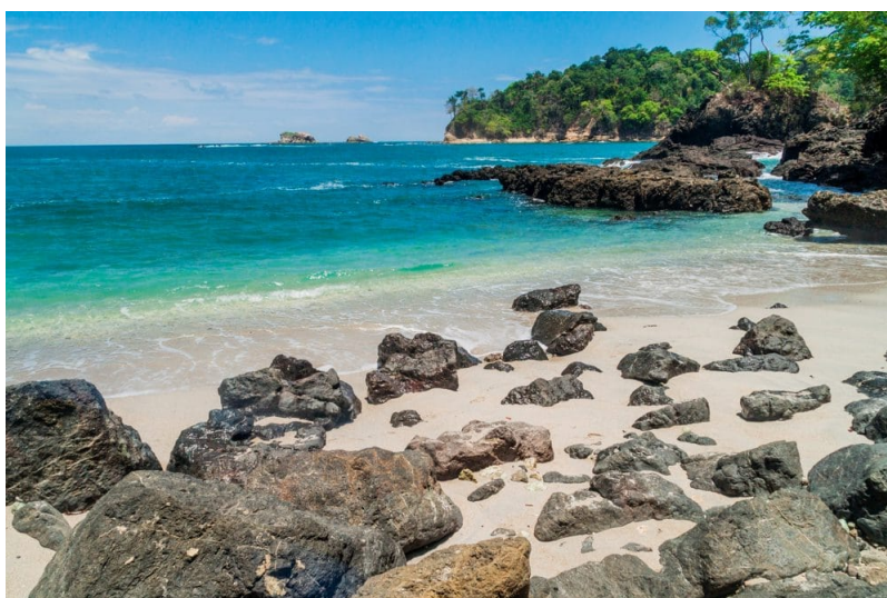
Beach in Manuel Antonio National Park

Nature's paradise: With a quarter of Costa Rica designated as protected land and with over 5% of the world's biodiversity, Costa Rica is a truly wildlife-lover's paradise and a