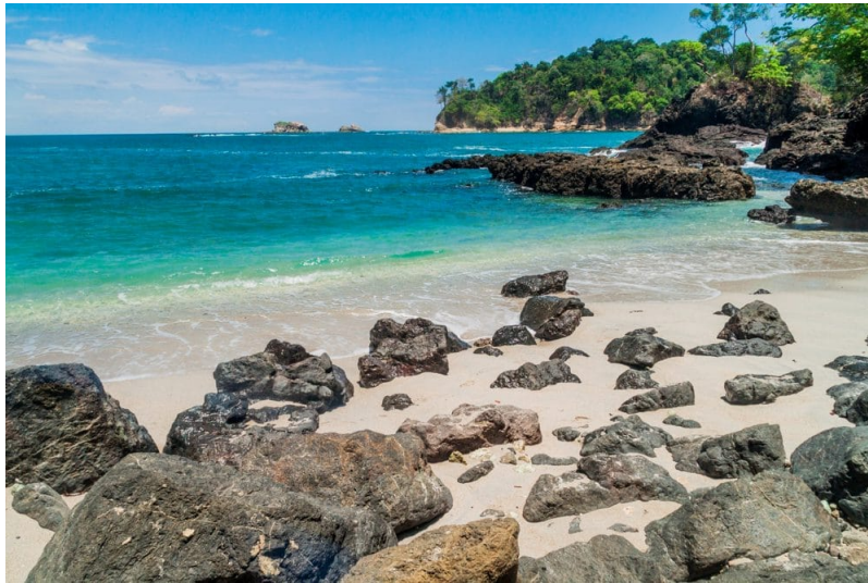
Beach in Manuel Antonio National Park

Nature's paradise: With a quarter of Costa Rica designated as protected land and with over 5% of the world's biodiversity, Costa Rica is a truly wildlife-lover's paradise and a fantastic destination for a family holiday.