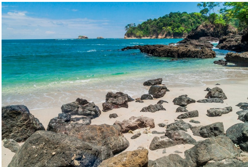
Beach in Manuel Antonio National Park

Nature's paradise: With a quarter of Costa Rica designated as protected land and with over 5% of the world's biodiversity, Costa Rica is a truly wildlife-lover's paradise and a fantastic destination for a family holiday.