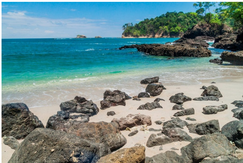
Beach in Manuel Antonio National Park

Nature's paradise: With a quarter of Costa Rica designated as protected land and with over 5% of the world's biodiversity, Costa Rica is a truly wildlife-lover's paradise and a fantastic destination for a family holiday.