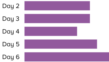
CSIV Distance Chart