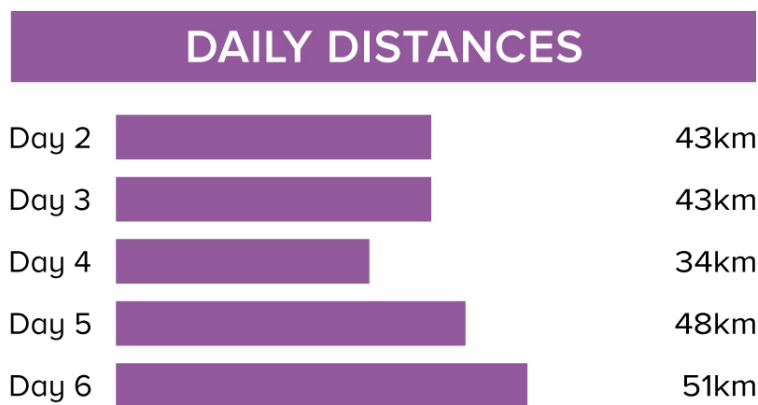
CSIV Distance Chart