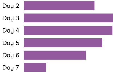
CSNG Distance Chart