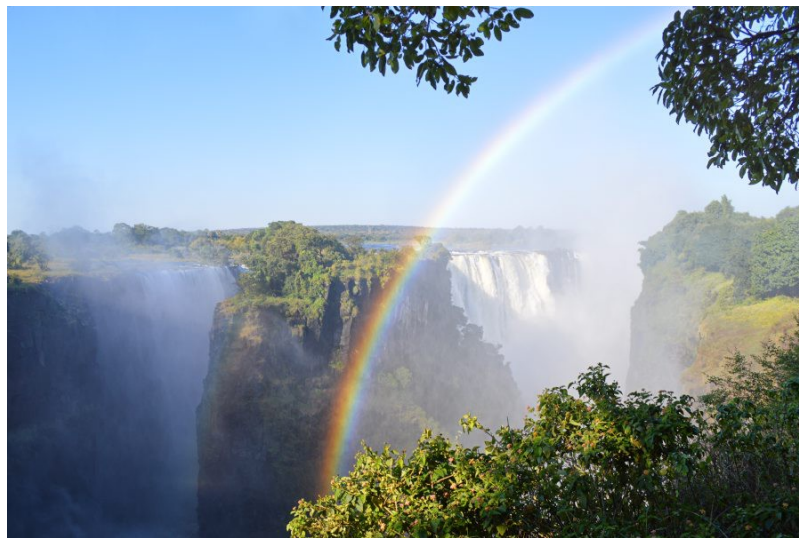
Victoria Falls Extension (VFE)