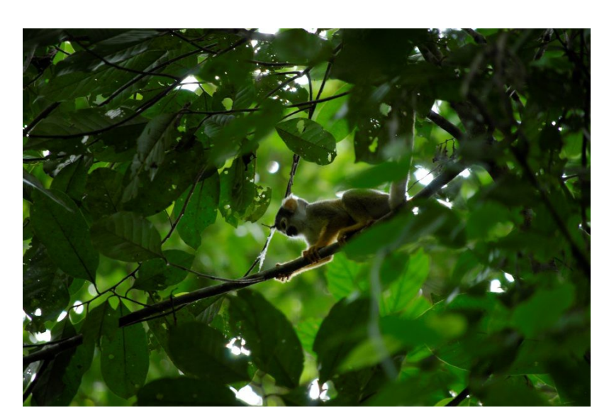
Extend your trip with 3 nights in the Amazon