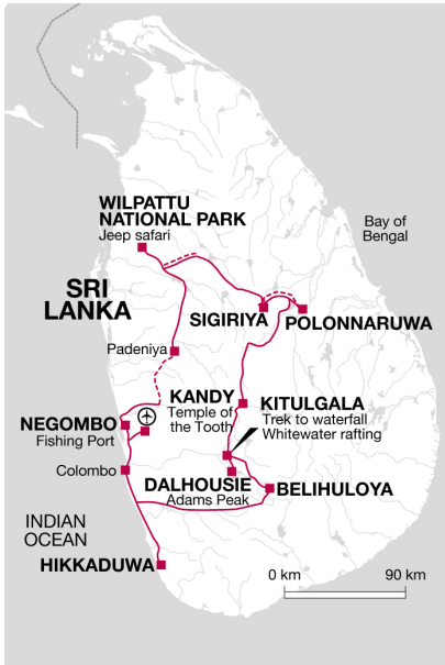
Adam's Peak Itinerary