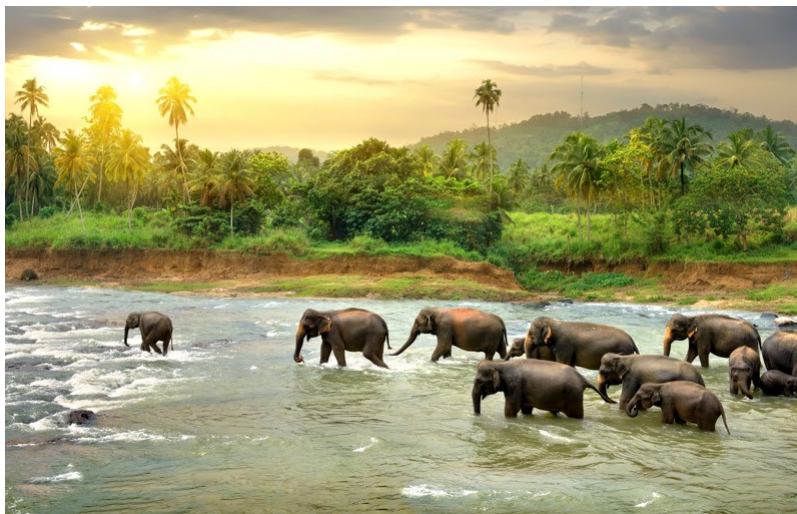
Elephant transit camp

Natural wonders of Sri Lanka: Sri Lanka is a compact country of amazing diversity, making it an ideal destination for children of all ages. Add in a four day cruise around the Maldives in a traditional dhoni boat and you have a winning combination.