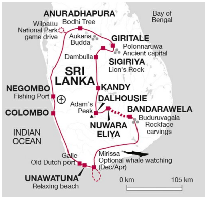
Adam's Peak Itinerary