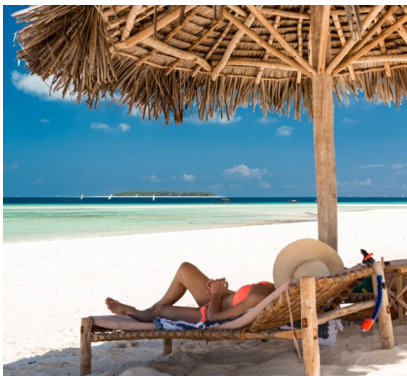
Beach time, Zanzibar Island