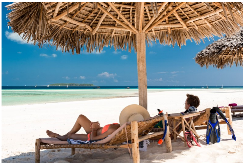
Beach time, Zanzibar Island

Travelling with kids on safari: We believe the key to a great all round safari trip in East Africa is to offer as much variety as possible. Whilst there is no doubt the experience of game drives will be the stand out highlight, we have blended additional family friendly activities alongside experiencing some of the premier national parks, which means you don't get a procession of long days in a safari vehicle. Everyone gets their spectacular close up wildlife encounters and the children get a chance to try out some exciting activities along the way, seeing a different side of Tanzania.