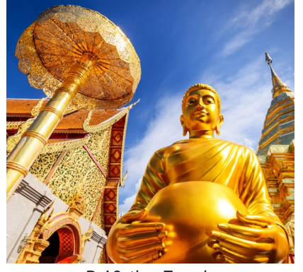
Doi Suthep Temple

Glittering temples, remote hill tribe villages: Discover a Thailand off the tourist trail with soaring peaks and steaming jungles, tumbling waterfalls and vibrant cities; all set against a back drop of a traditional way of life.