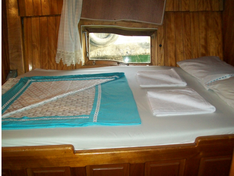
Typical cabin on board

Gulet information: Our traditional gulet is hand built in teak and pine, with a spacious and partly shaded foredeck and comfortable indoor and outdoor lounge areas. Meals are prepared on board by the boat chef and enjoyed in the shaded aft deck. There are four twin and four double cabins (no triple cabins available although it is possible to sleep on deck), all with an en suite bathrooms and plugs in the communal areas to charge mobile devices and cameras.