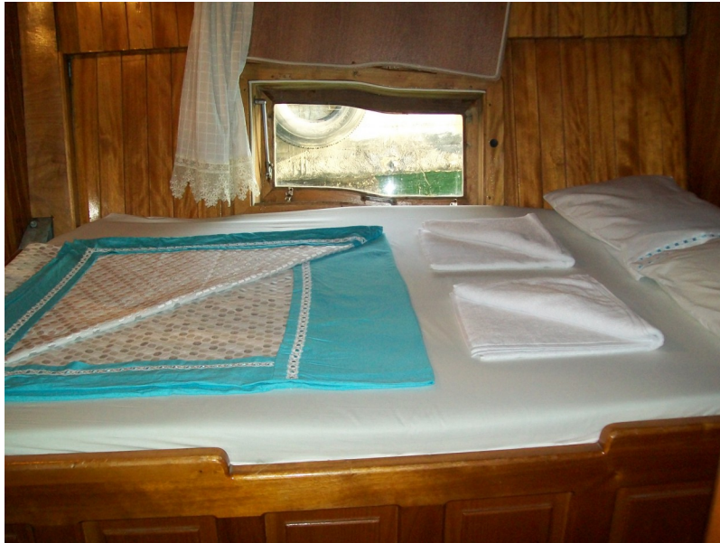
Typical cabin on board

Gulet information: Our traditional gulet is hand built in teak and pine, with a spacious and partly shaded foredeck and comfortable indoor and outdoor lounge areas. Meals are prepared on board by the boat chef and enjoyed in the shaded aft deck. There are four twin and four double cabins (no triple cabins available although it is possible to sleep on deck), all with an en suite bathrooms and plugs in the communal areas to charge mobile devices and cameras.