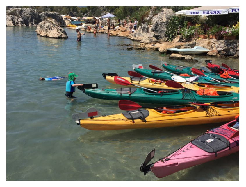
Sea Kayaking in Kas