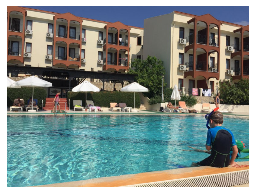
Hotel pool in Kas

Active family holiday on Turkey's Mediterranean coast: Our base for the week is the picturesque seaside town of Kas. Perfectly located mid-way between Dalaman and Antalya bordering the crystal clear waters of the Mediterranean. Spend days on the water, kayaking along rivers and in the sea, and sailing on a traditional gulet, snorkelling and swimming from the boat. We also have a full day to amble along village trails in the Taurus foothills as well as free time to explore more of the region steeped in history and blessed with breath-taking beauty.