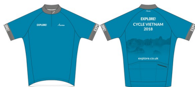
Cycle Vietnam Jersey

Unlike many other operators, we include the hire of your bike in the overall cost of the holiday: you don't need to bring your own or pay extra to hire one locally. We also provide a support vehicle, spare parts and take care of day to day bike maintenance. All you need bring is your own helmet.