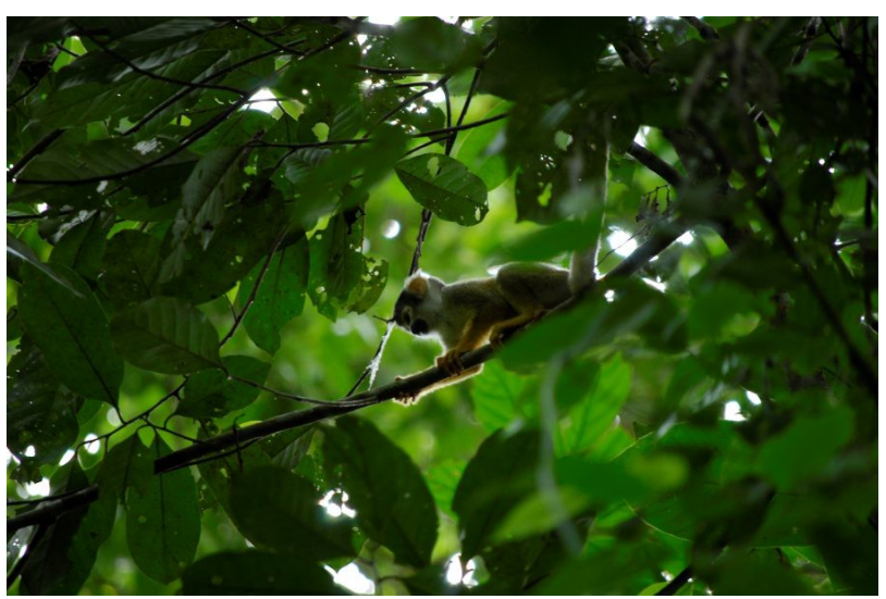
Extend your trip with 3 nights in the Amazon