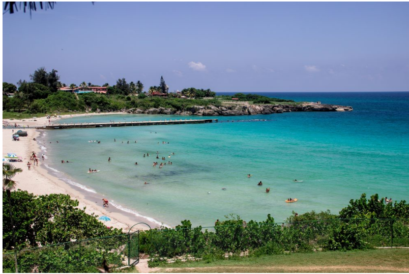
Extend your trip on Playa Jibacoa