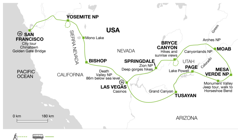
17 day trips including Moab and Mesa Verde