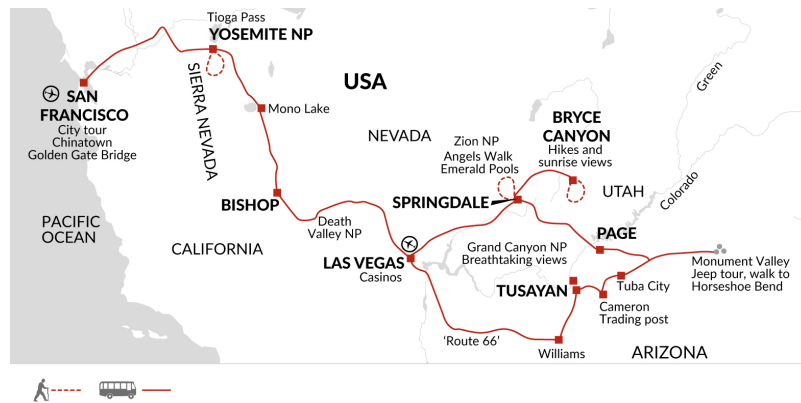
14 day itinerary map (summer)