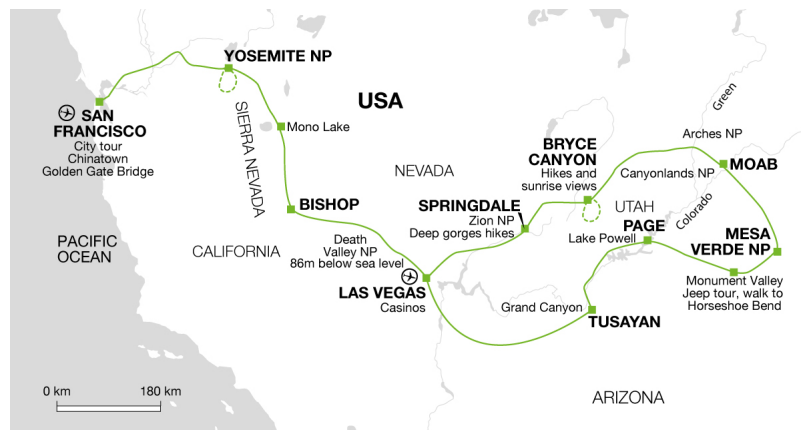
17 day trips including Moab and Mesa Verde